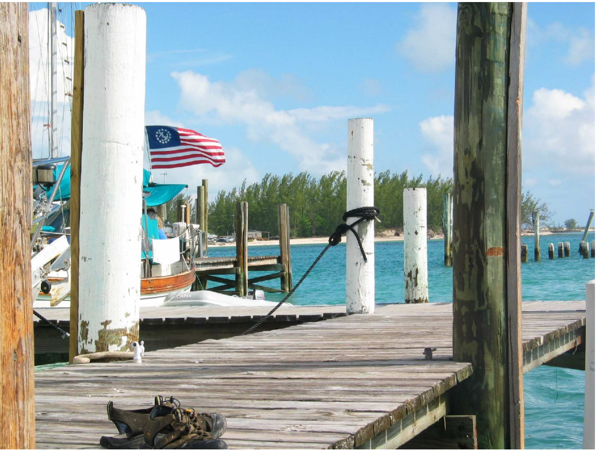
The weather cleared up in the afternoon, and the wind picks up