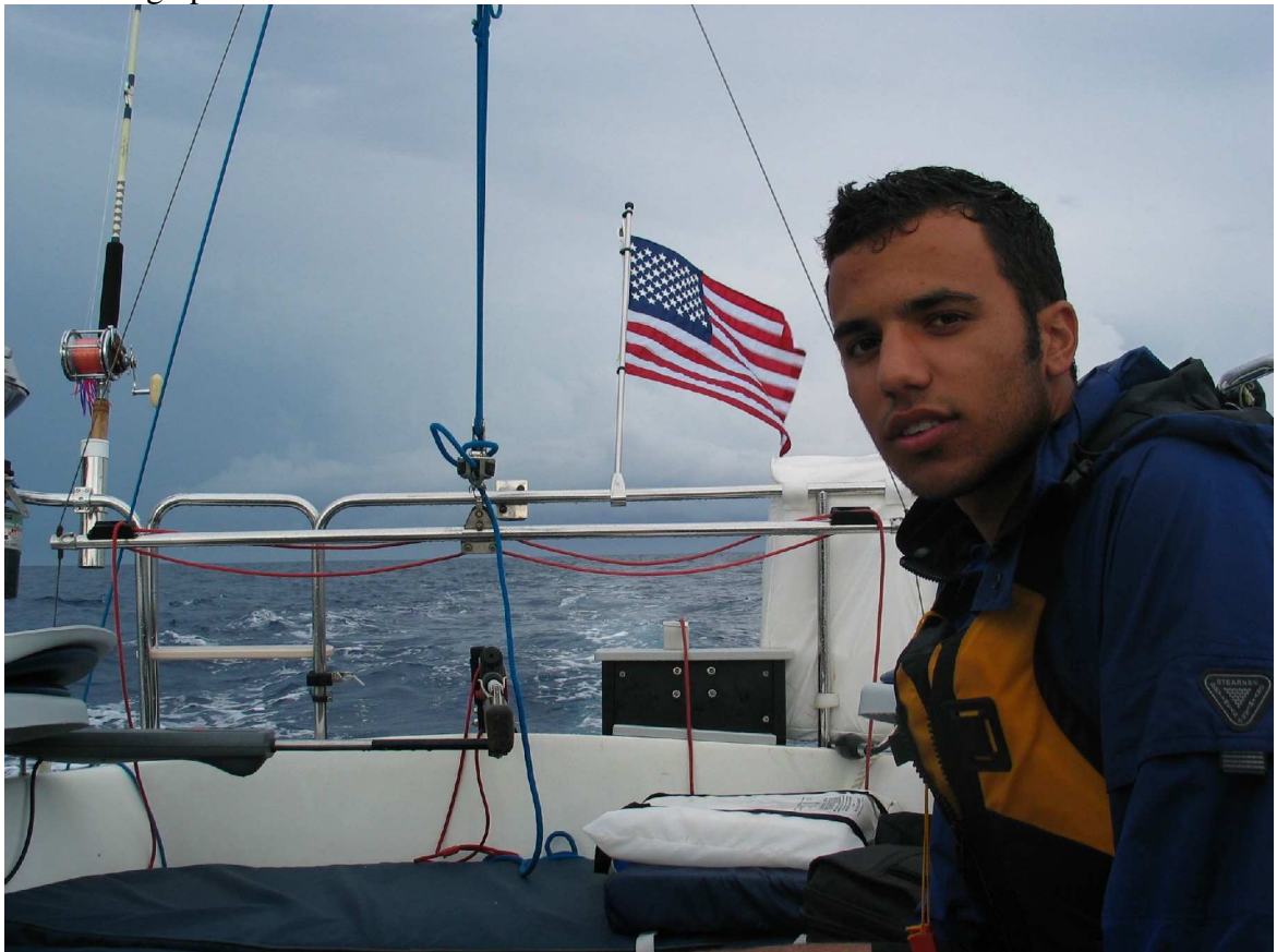
Storms close in around us out in the Gulf Stream

It was now 0745 as we headed into the Gulf Stream and the great unknown. Seas were running 3 feet or so, but they were not the steep chop that we experienced on the Great Bahamas Bank so it really wasn't all that uncomfortable. What was uncomfortable was that the weather began deteriorating again as soon as we got offshore. The clouds started closing in all around us. Ahead of us were darkening skies that seemed to be moving toward us, and to the southeast was another dark ominous storm that seemed to be catching up to us from behind. We were 2 hrs. and 12 miles out into the Gulf Stream.