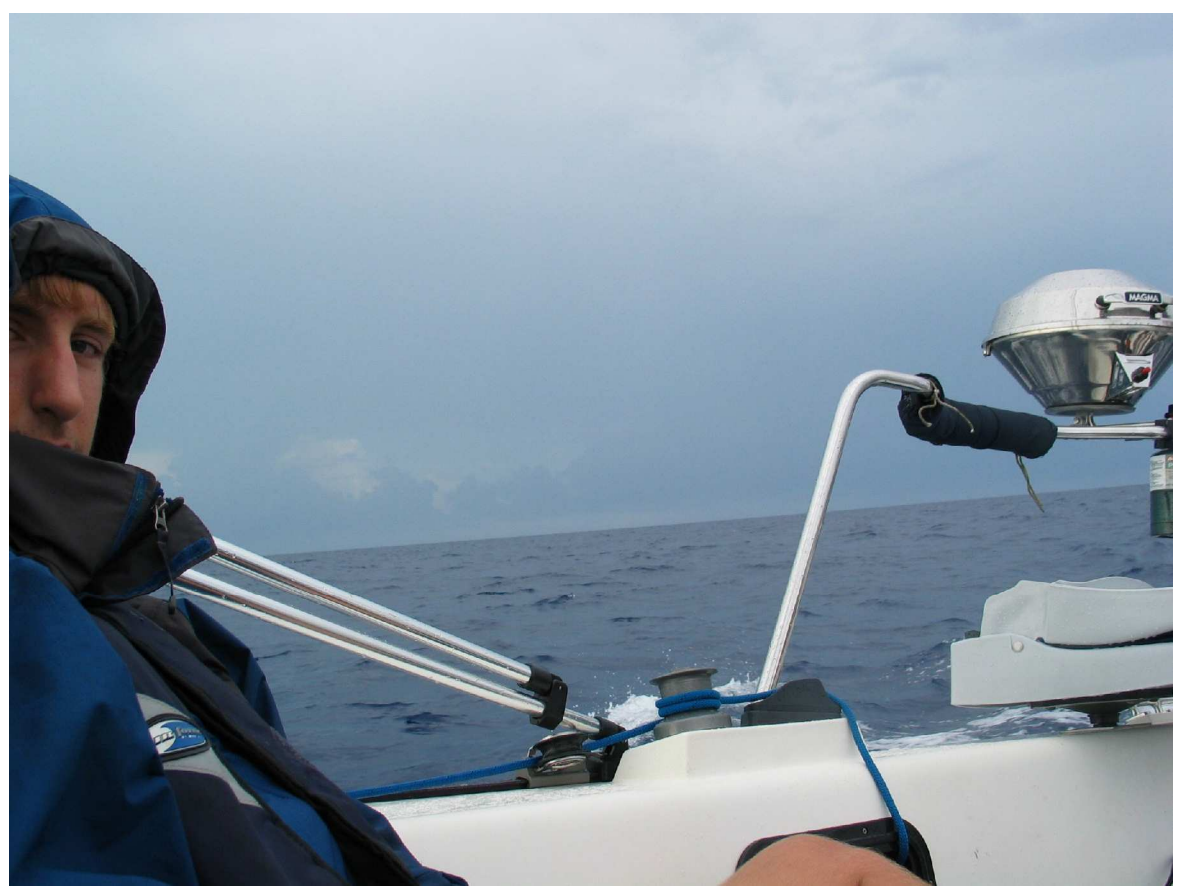
Bad Karma. We turn back to Alicetown

Had I been in a larger sailboat, perhaps we would have felt more comfortable, but given our size I felt very uneasy messing about in the Gulf Stream with the winds, waves, and lightening that accompany these storms. So as isolated and scattered as they might have been, it sure looked for the world like the entire Bahamas were about to get it. I made the decision to turn back to a safe harbor: Alicetown. Discretion is the better part of valor.