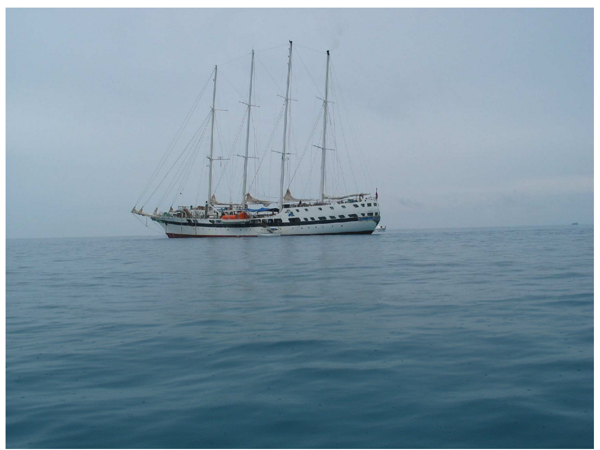
Look closely and you can see smoke. It was a hazy windless day.

Leaving the harbor was a snap with the new channel markers. Just outside the entrance channel, we saw a small cruise ship posing as a sailboat anchored. We got a good laugh at seeing smoke billowing out of the top of one of the masts; or should I say it was a smoke stack disguised as a mast. We made sure to sail past it under the longing gaze of the tourists that were trapped on the deck like bilge rats, waiting for their tender ride to town.