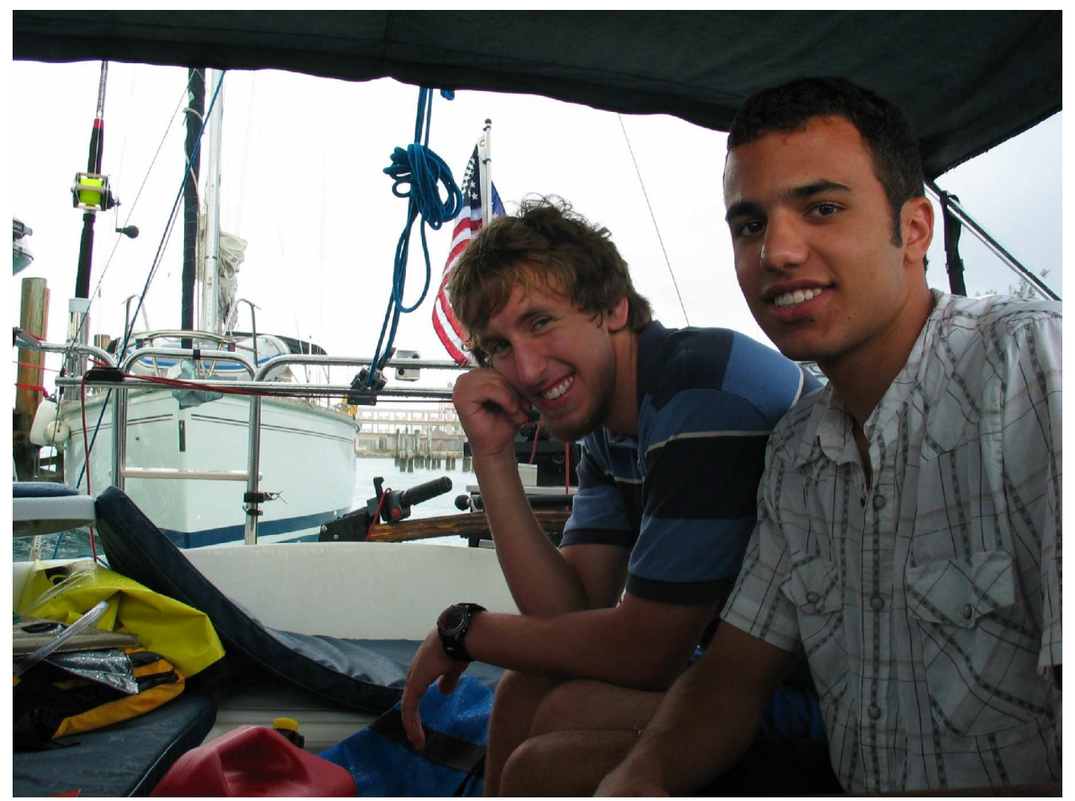
Nestled at Weech's just prior to departure

By mid-day the rain had moved on and the skies lightened. Although there was still a haze, we decided that we had been in port long enough. There were adventures to be had out there.