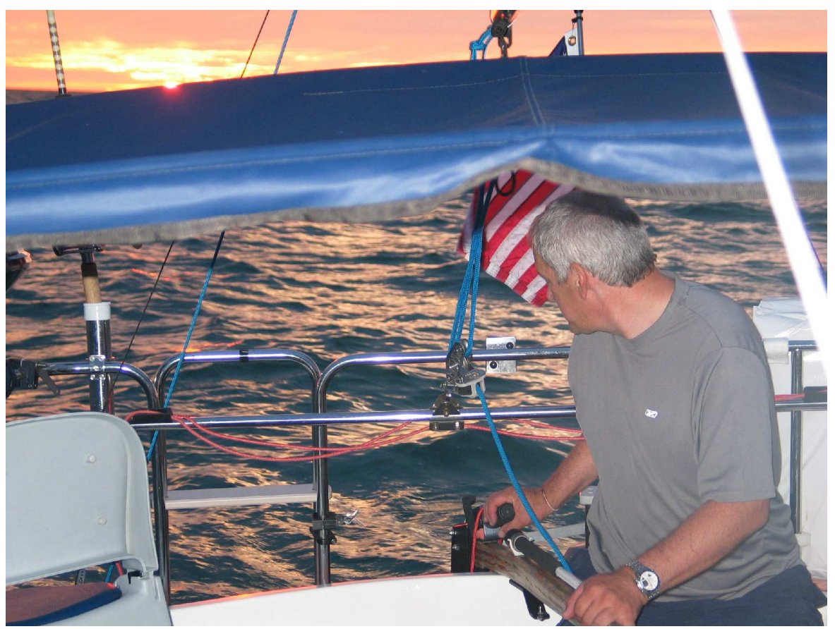
Backing down on the anchor. There was a nasty chop that got worse later that night.

Finally anchored, the sun was now just touching the horizon so we wasted no time breaking out our dinner. Because it was so late, and because we had no fish, I knew that the best course of action would be to keep dinner simple. However, we had only had a light snack for lunch and 18 year old boys eat a lot more than "light snacks". They wanted something of substance, and I was dying to try out my new "magma" gas grill. So out came the hot dogs.