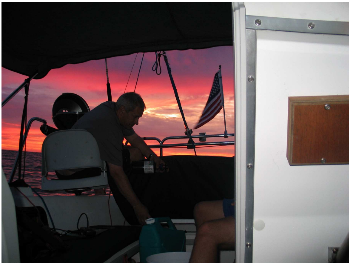
Breaking in the Magma during beautiful sunset.