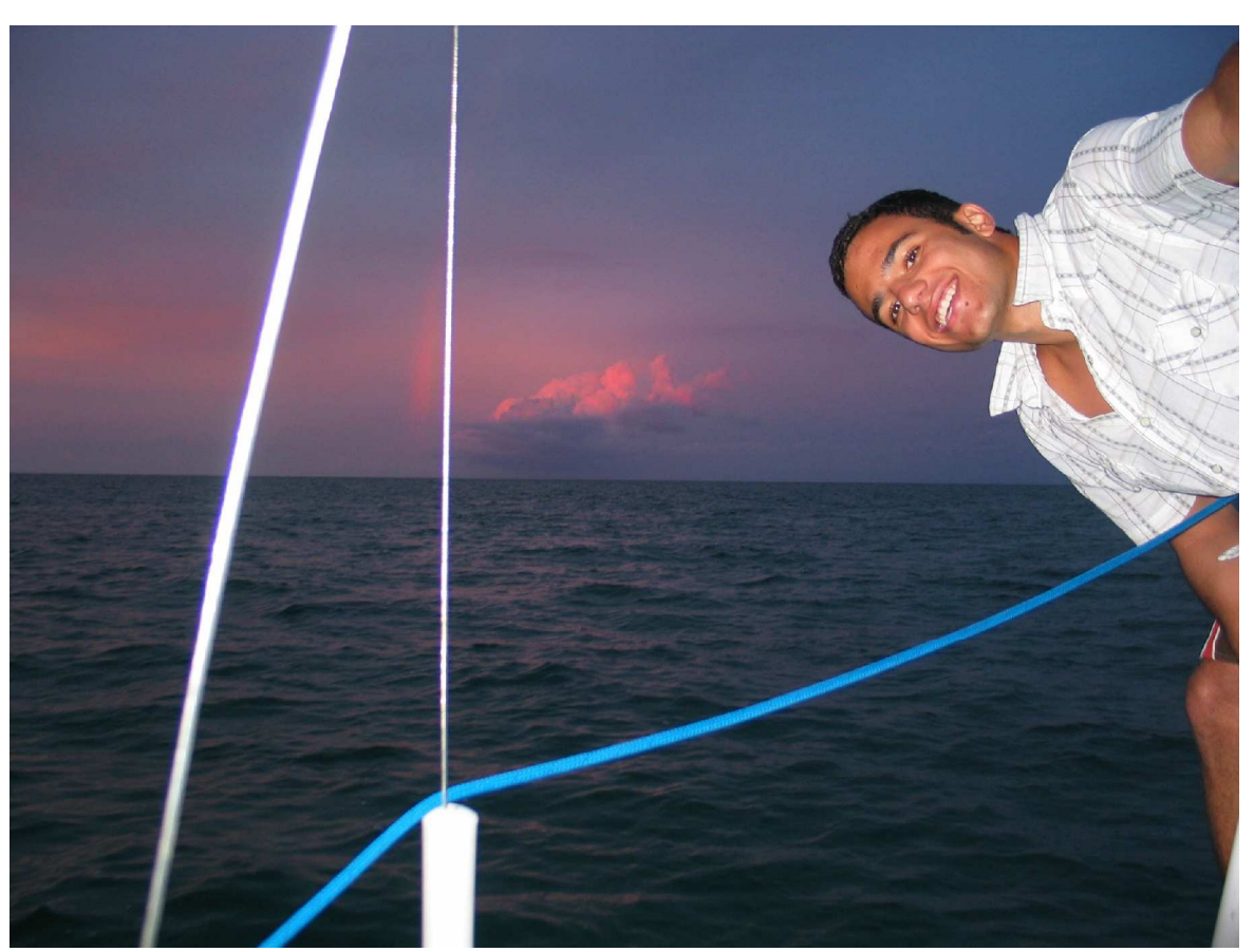
Skies cleared as the setting sun cast a pink glow on distant clouds