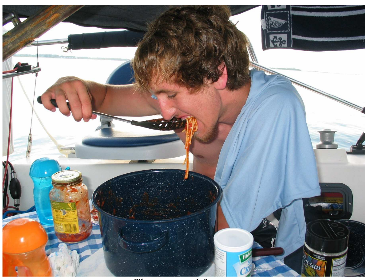
There were no leftovers