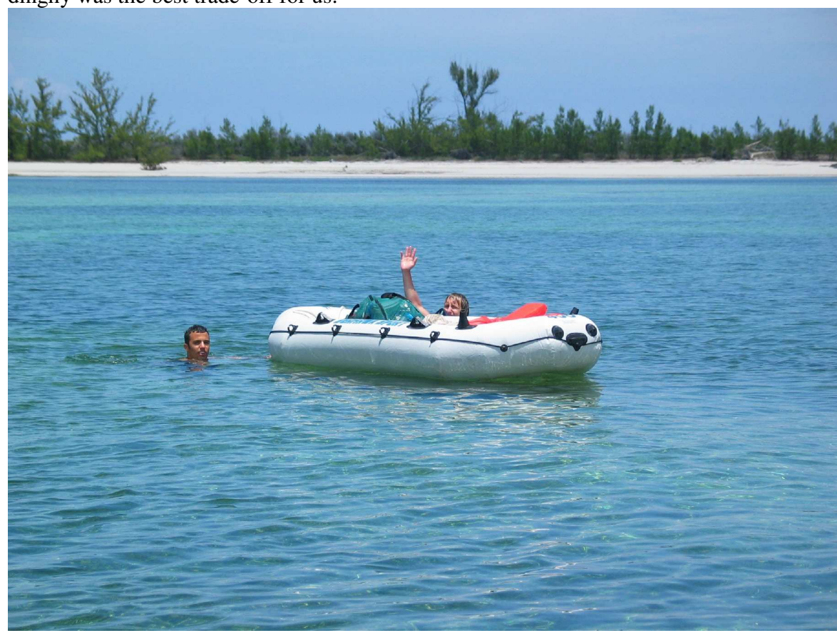
It was easier (more fun) to swim with the dinghy than paddle it.

Given the size of the Rhodes, combined with the shallow water in which we could anchor, I was quite satisfied with the choice of dinghy. I didn't have to fuss with another outboard motor and worry about how/where to store it. The SeaEagle dinghy folded up easily under the cockpit seat, whereas the other dinghy would have had to be tied down on the bow and would have been a hindrance when not in use; which was quite often given the long passages we made. In fact, we rarely ever used the dinghy for human transportation. Instead we would load up the dinghy with our "toys" and swim or wade to shore, dragging the dinghy behind. There was probably only one day during the whole trip that it would have been nice to have a motorized dinghy to explore the area and get to and from a remote eatery. All in all, going with the simple, lightweight oar powered dinghy was the best trade-off for us.