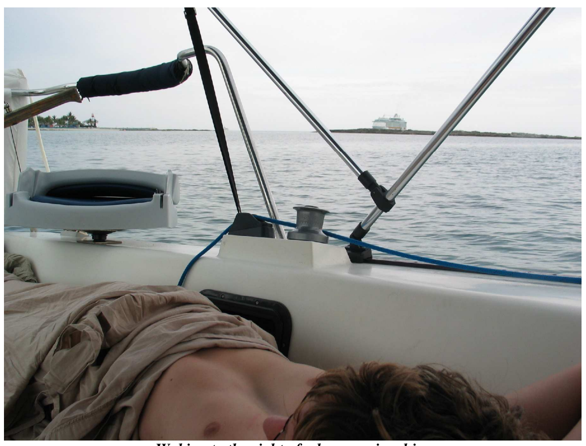
Waking to the sight of a huge cruise ship