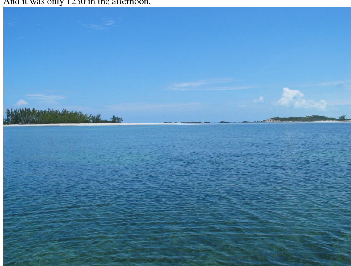
Hawksnest Cay. You can see the sea grass, poor holding.

Once again my trusty mapping GPS guided us around a rock outcropping and into a large shallow bay on the leeward side of Hawksnest Cay. We were the only ones there. And it was only 1230 in the afternoon.