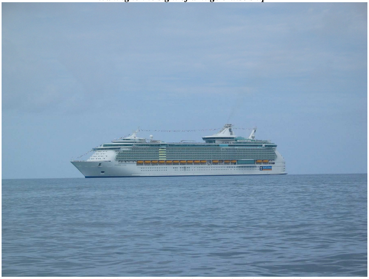
As nice as it looked, I was glad to be on my little boat...and free.