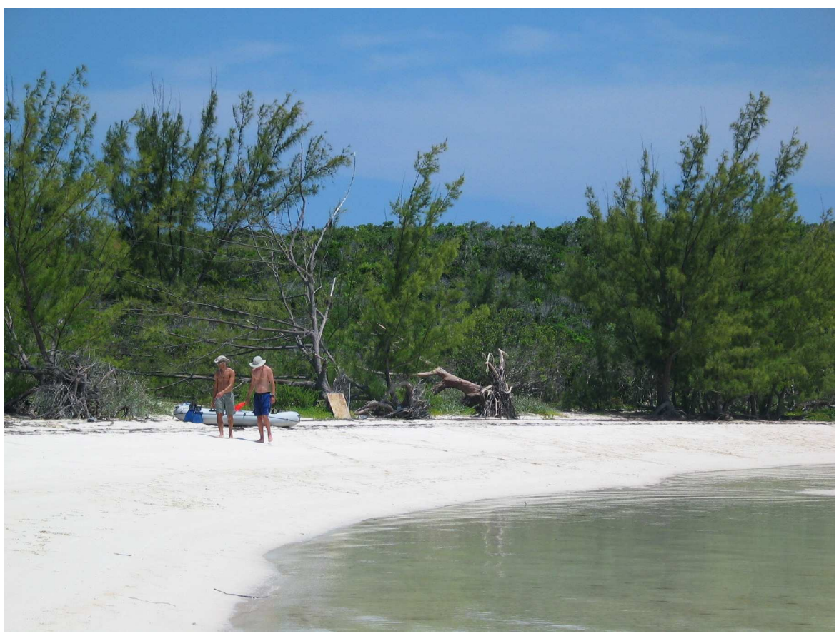
Exploring the Beach

Besides the anchored boats, several high speed power boats had beached themselves and disgorged large families of loud South Americans that headed into the brush to see the blue hole, so instead of rushing off behind them, we decided to swim and snorkel the area, and visit the hole later in the afternoon after everyone left. Snorkeling was pretty good here, but interestingly not nearly as good as some other places I've been. It didn't take me long to explore the cove and I was back at the boat. I took a few minutes to scrub the slime from the bottom of the boat that remained from my lake back home. The salt water had completely killed it and remnants sloughed off with ease. Now that's a good way to clean lake scum off your hull; take it to the salt water!