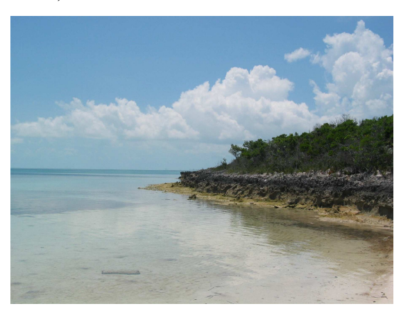
The Barracuda Spot

After I finished my chore and settled in for some serious lounging, the boys suddenly appeared, pulling themselves quickly up over the side of the boat with a strange look on their faces. They were trying to act like it was no big deal, but they told me how they had been stalked by a barracuda. They claimed it was larger than the one we hooked back at Bimini. I asked them if it had a hook in its mouth. It might be looking for revenge. No hook, but they were not about to go back and tempt fate.