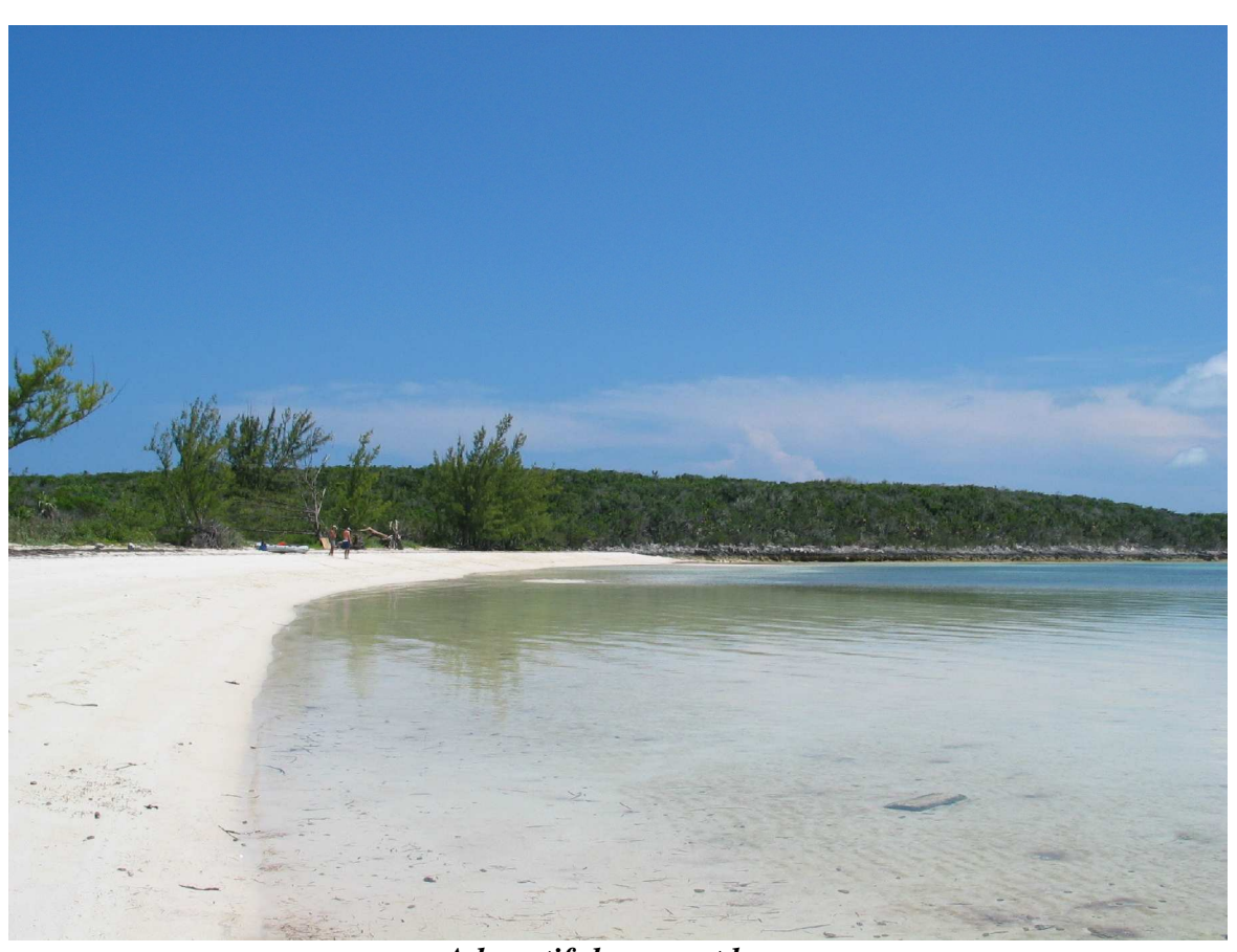
A beautiful crescent bay