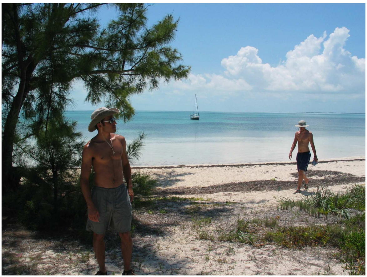
Heading into the island's interior. We have the island all to ourselves.

Late into the afternoon, all of the island guests had departed save us. So with the island all to ourselves, we set out on a short walk to the blue hole. Matt had visited this spot two years ago while on a Boy Scout trip and remembered it fondly. He explained to us that a blue hole is simply a very deep hole in the ocean floor that is located in an area of shallow water. There are many blue holes sprinkled throughout the Bahamas, but most are located in open water areas. The blue hole on Hoffman's Cay is unique in that it is located in the middle of an island, and although it is several hundred yards from the beach, the water in it is salty and rises and falls with the tide. No one knows how deep this hole is or how it is connected to the ocean. Or so that is what Matt claimed.