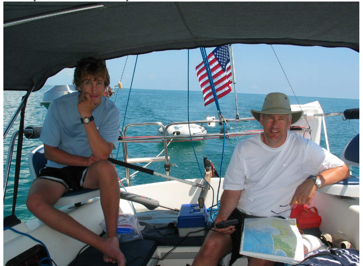
The sloow motorsail

Winds were out of the E/SE and very light for a second straight day so we once again had to motor sail most of the way. I was really glad to have the 9.9hp motor, but we had already burned half of our fuel and had now passed the point of no return. We would have to get fuel at Chubb Cay, or hope for better wind. Consequently, we motored sailed at a low idle to conserve fuel and took over 4 hours to reach our destination that was only 12 nautical miles away.