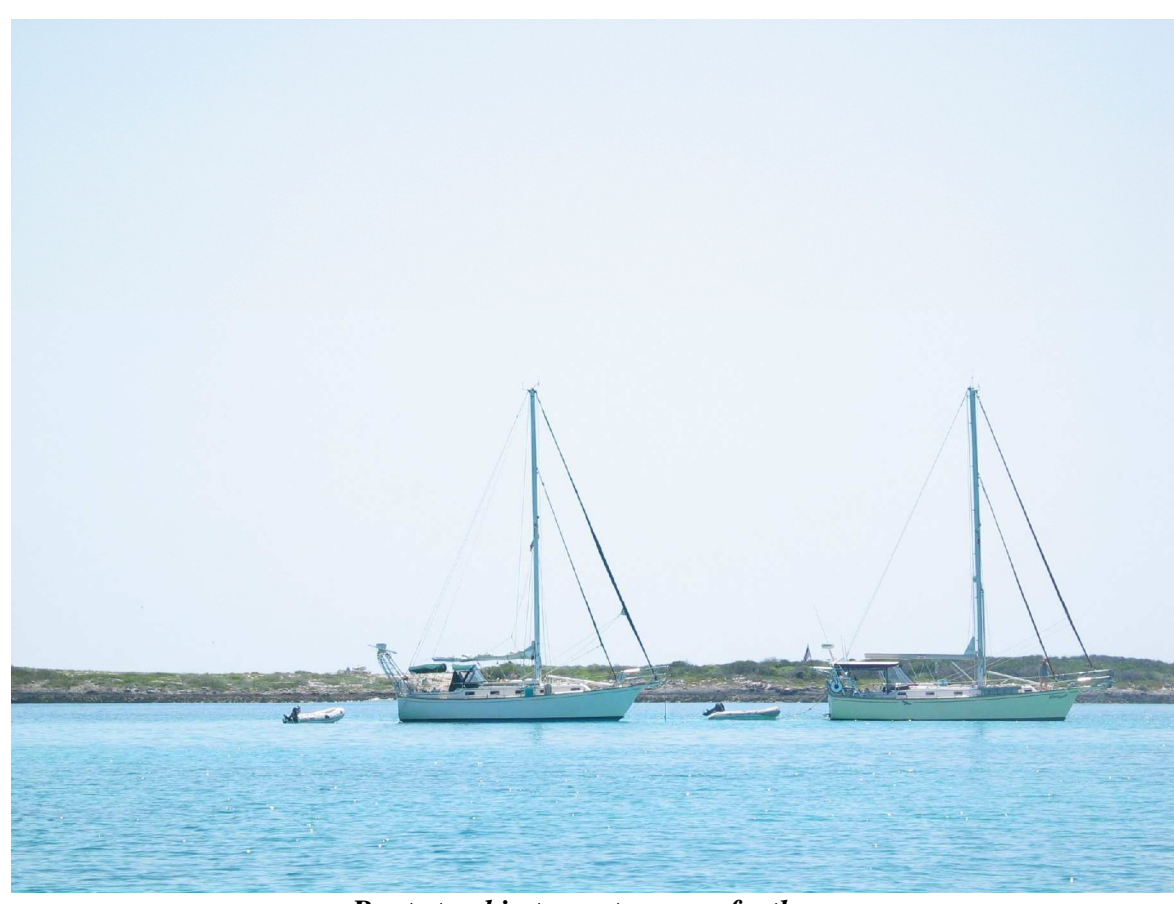
Boats too big to venture any further

It is interesting to note that the captain of one of the vessels we passed approached us later that day (in his dinghy) and commented that he didn't know that the water was passable all the way to the blue hole. Ahh, the joys of a shoal draft keel. He was impressed that we had made it. It really wasn't all that hard. I kept a crew on the bow to help read the water and kept the boat moving slowly with my centerboard (I mean depth gauge) down. I didn't tell the gent that is was easy. It felt much too good being admired.