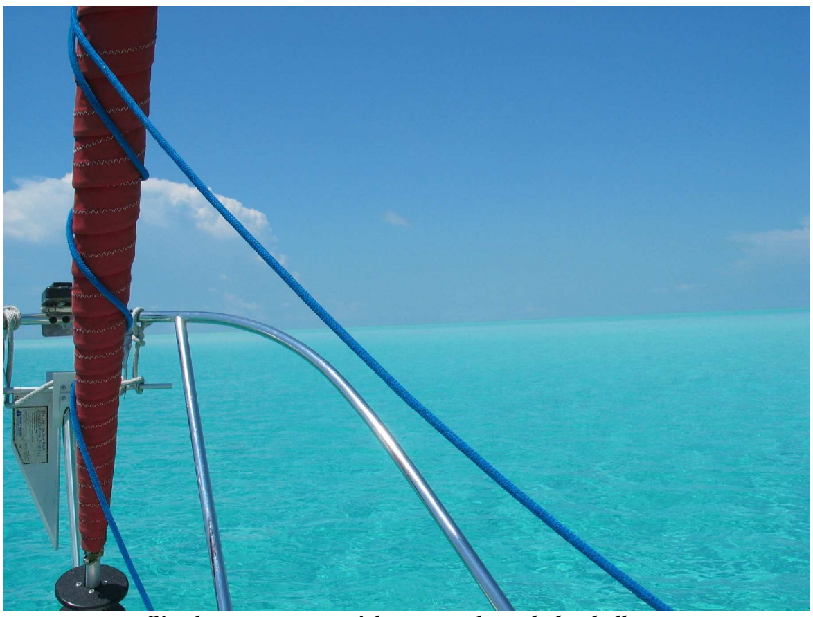
Gin clear water as we pick our way through the shallows