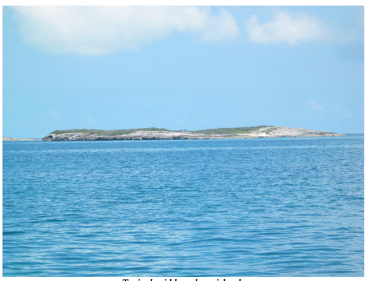
Typical arid low slung island