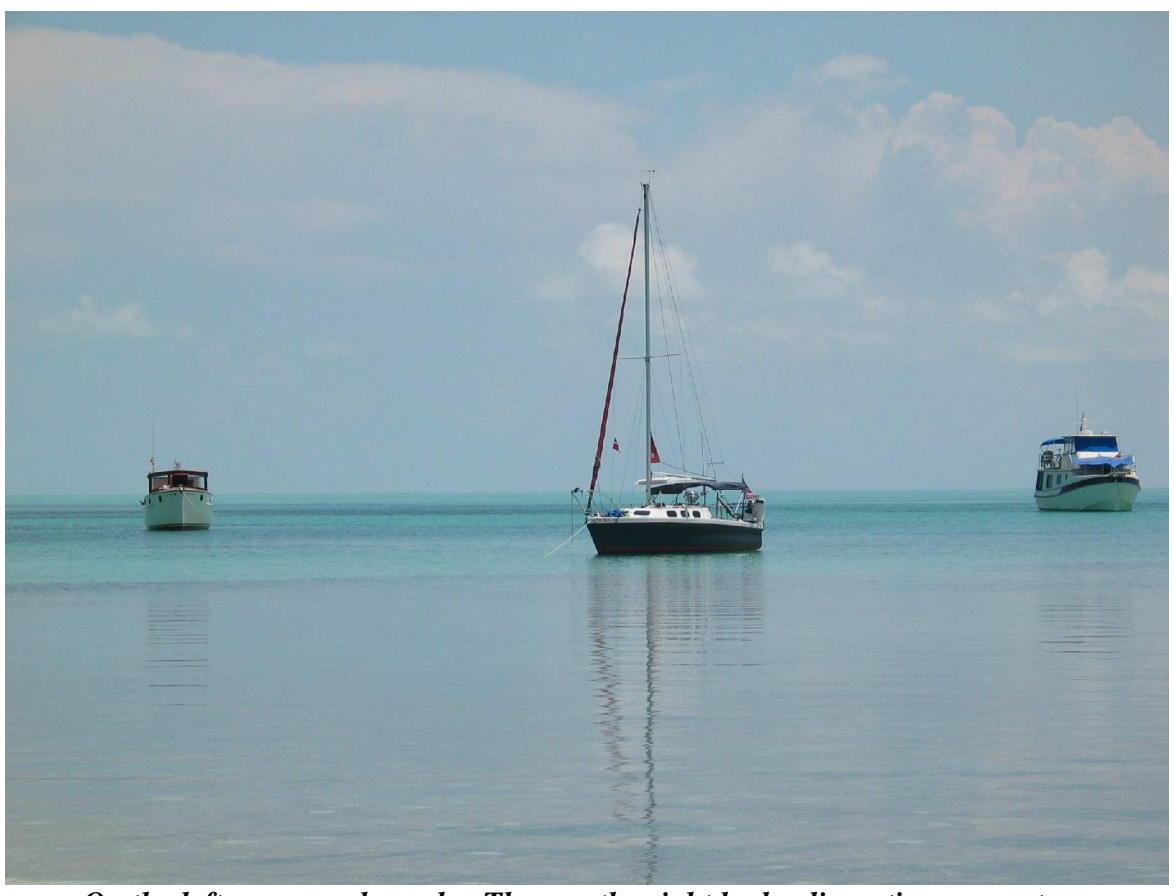
On the left was a cool woody. The one the right had a disgusting generator.