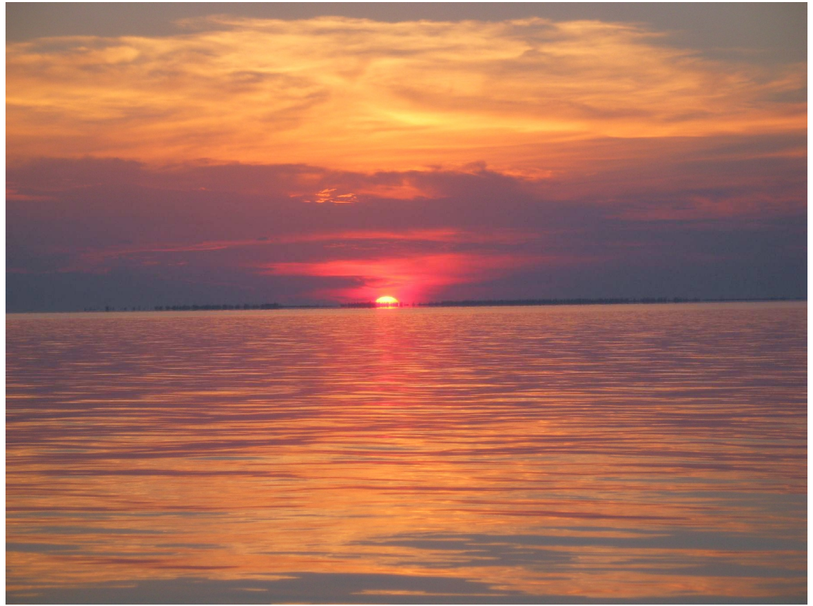
Another Perfect Sunset in Paradise

After the sun dropped below the horizon the wind died to a dead calm, and the mosquitoes came out from the island to join us. Whoever says that there are no mosquitoes in the Bahamas has obviously never anchored at Hoffman's Cay. There was no threat of rain so we took down the bimini and put up a large mosquito net that I had packed along "just in case". It proved to be one of the most valuable pieces of equipment on the boat. Nothing will drive a crew more insane than being harassed by mosquitoes; especially when trying to fall asleep. The netting was large enough that when attached to the bottom of the boom, it covered the entire cockpit and cabin with the pop top raised. I didn't put up the pop top enclosure so had improved ventilation which was enhanced by the 12v fan that I ran all night. Between the mosquito netting, the tarp, the bimini, the pop top, and the pop top enclosure, there were many options for shelter configurations that allowed us to meet nearly every circumstance. I'm sure that given more time and ambition, we would have eventually figured out an efficient way to configure the tarp as a rain shield that worked better than the boys simply wrapping it around their bodies. But boys will be boys, and they were quite content with wrapping themselves like a burrito when the tarp was needed.