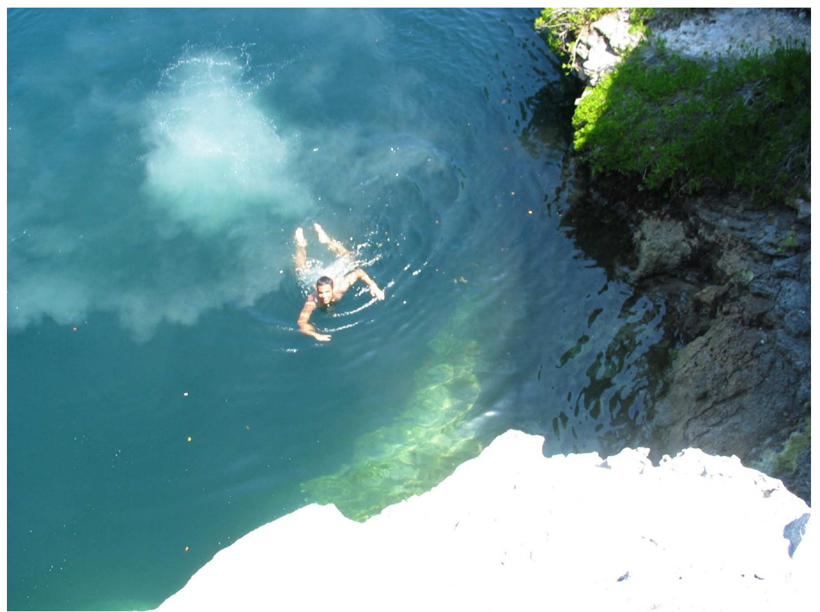
Swimming in a bottomless pit