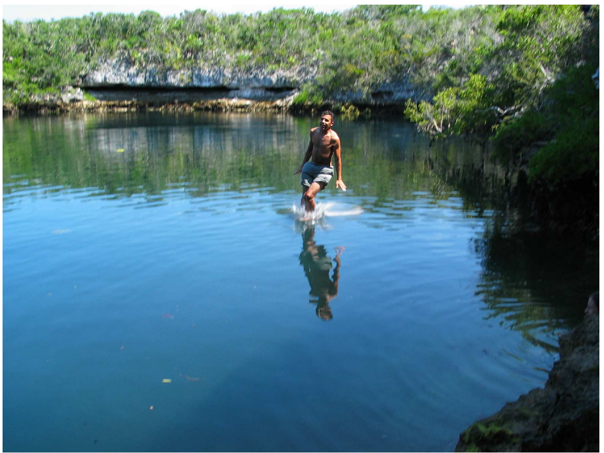
Is Joe tail walking like a dolphin?