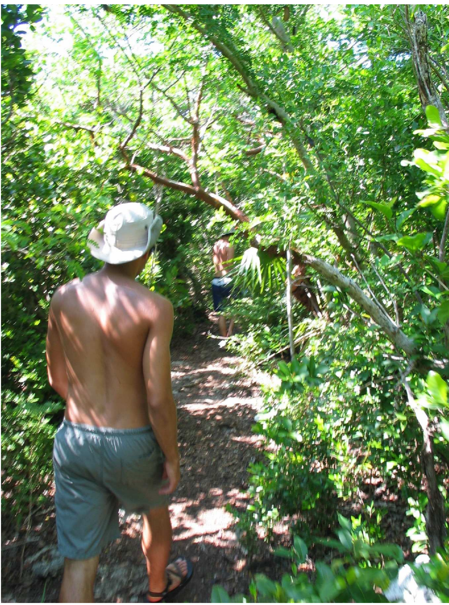
Hiking through mosquito infested underbrush

The story continues on Day 6 as we leave the beach and the safety of our boat to venture through the jungle to the famous blue hole of Hoffman's Cay.