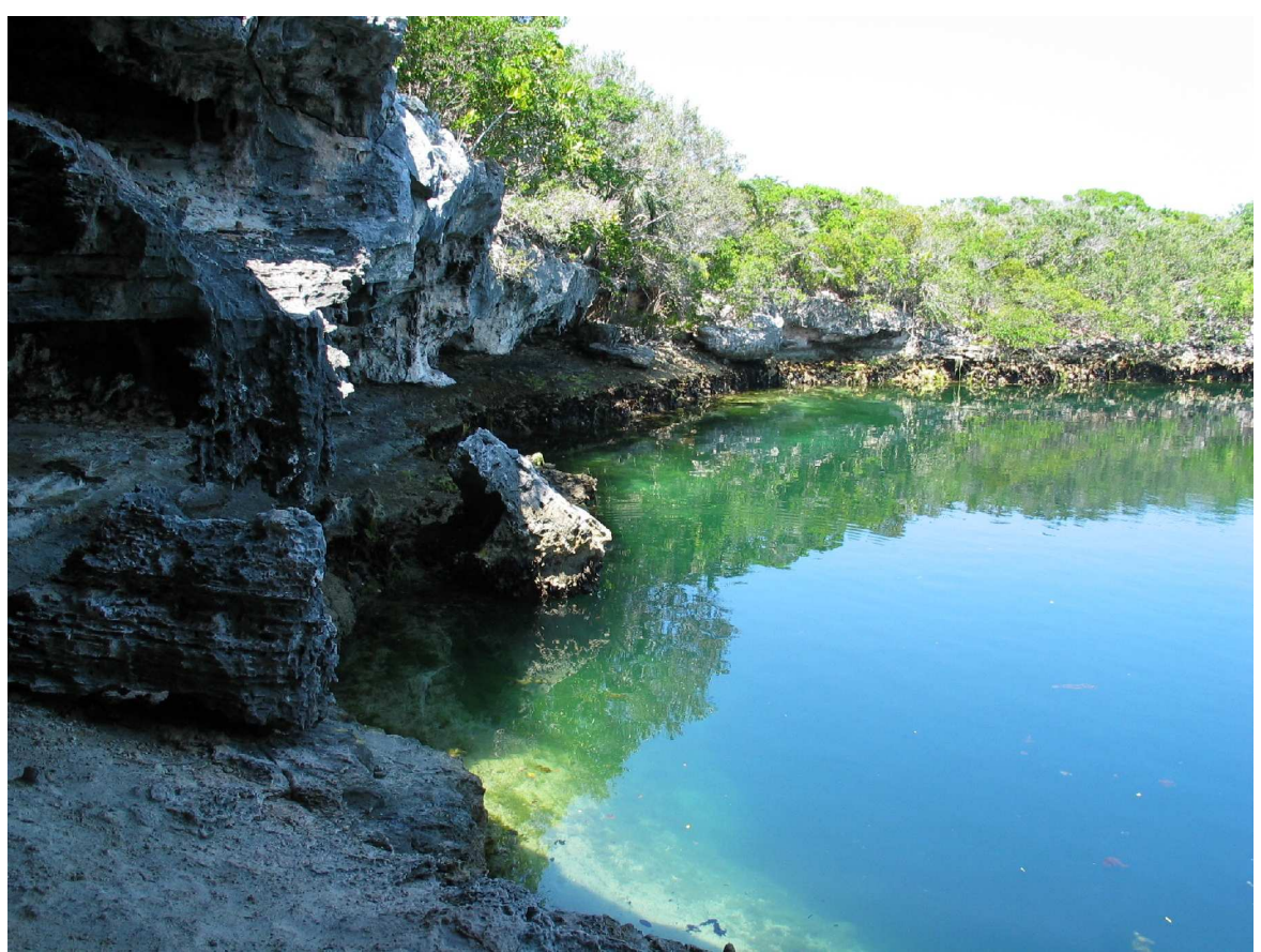
A view of the blue hole from under the ledge