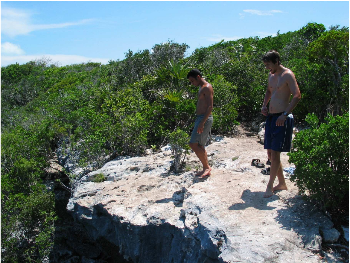
Who goes first? Not me, I'm taking pictures