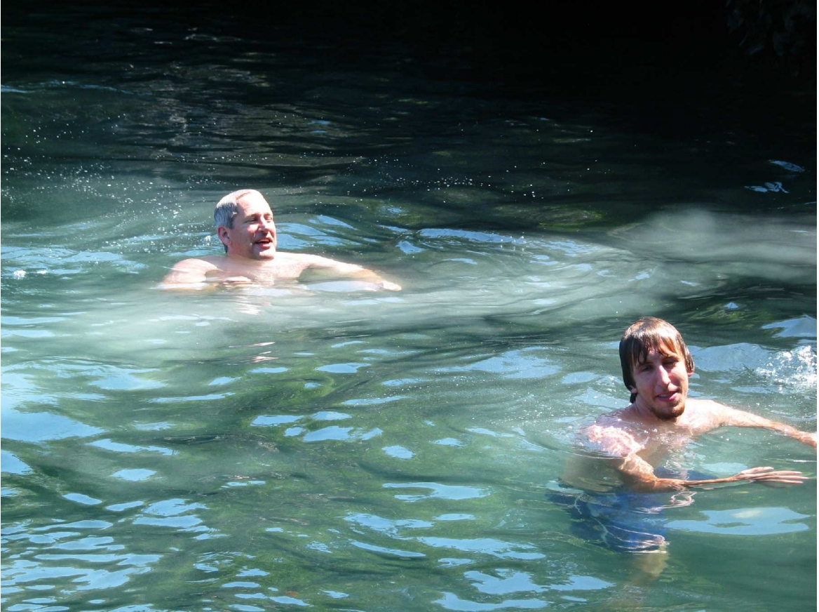
It's great to be a kid again