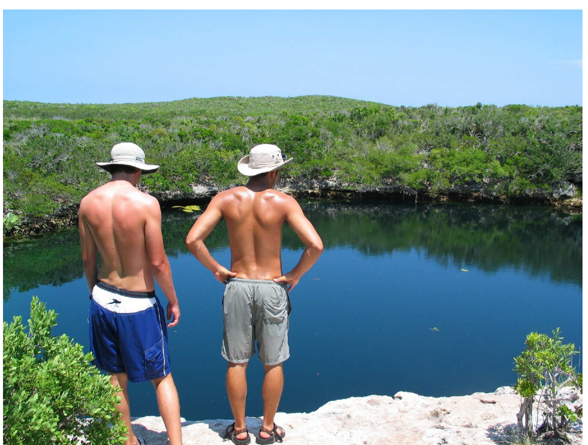
Looking down into the Blue Hole

Looking straight down, I was surprised to see a very large grouper looking back up at me. Dinner? Apparently, the grouper has lived in the blue hole for years and has become somewhat of a mascot. It lives off of the handouts from the swimmers and begs for food like a dog.