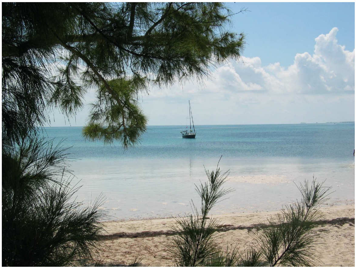
It was nice to see the boat waiting for us upon our return.

Our stomachs began to growl so we headed back to the beach and our boat. On the way back we encountered another trail that appeared to loop around the blue hole. Deciding to be the great explorers we started down this lightly traveled trail to see what treasures we could find. What we found was the biggest swarm of voracious mosquitoes I have ever encountered. We were covered instantly. If anyone had been there to watch us emerge from the jungle, they would have thought we were either crazy or being chased by cannibals. Climbing over each other in our haste, we charged out of the woods and dove into the water. Then, with noses just above the water, we argued for some time about who would have to get out of the water and retrieve our dinghy. Joe lost and nursed his mosquito wounds for days afterwards.