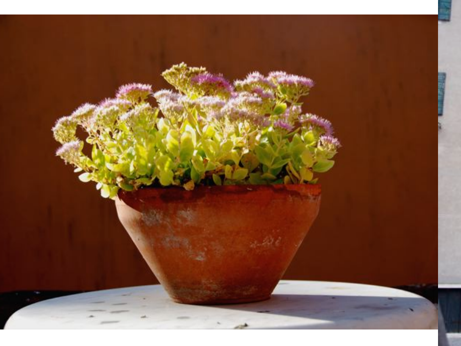
A pot of sedum in the morning sun..

The picture on the right shows how owners attempt to stabilize their buildings with threaded rods when the structure begins to fall outward.