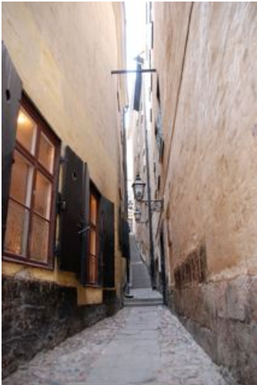
GamlaStan had many narrow, cobble sidestreets leading to residents' homes. Very much a reminder of Venice.