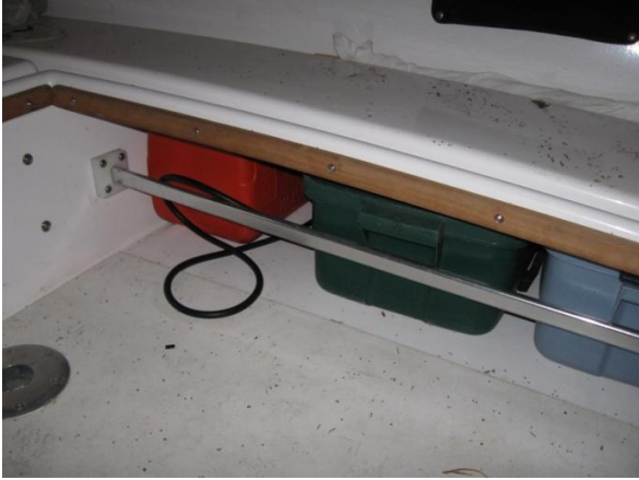
Cockpit bracing bars of anodized aluminum looking aft to port.