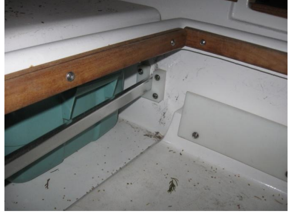
Looking forward, note "U" shape of forward socket which allows bar to be removed.