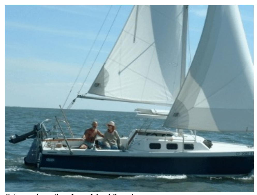
Orion under sail on Long Island Sound.

Phone: 207-832-7228 until early October, 2012