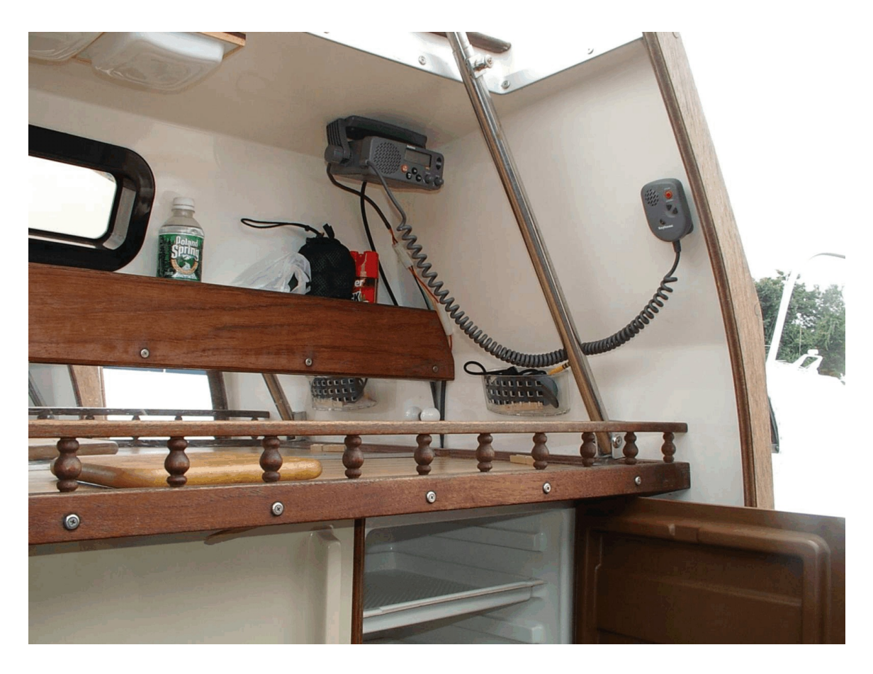
Classic Rhodes 22 interior.