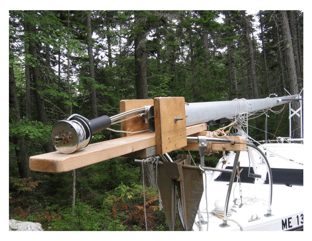
Front mast fitting for trailering and storage.