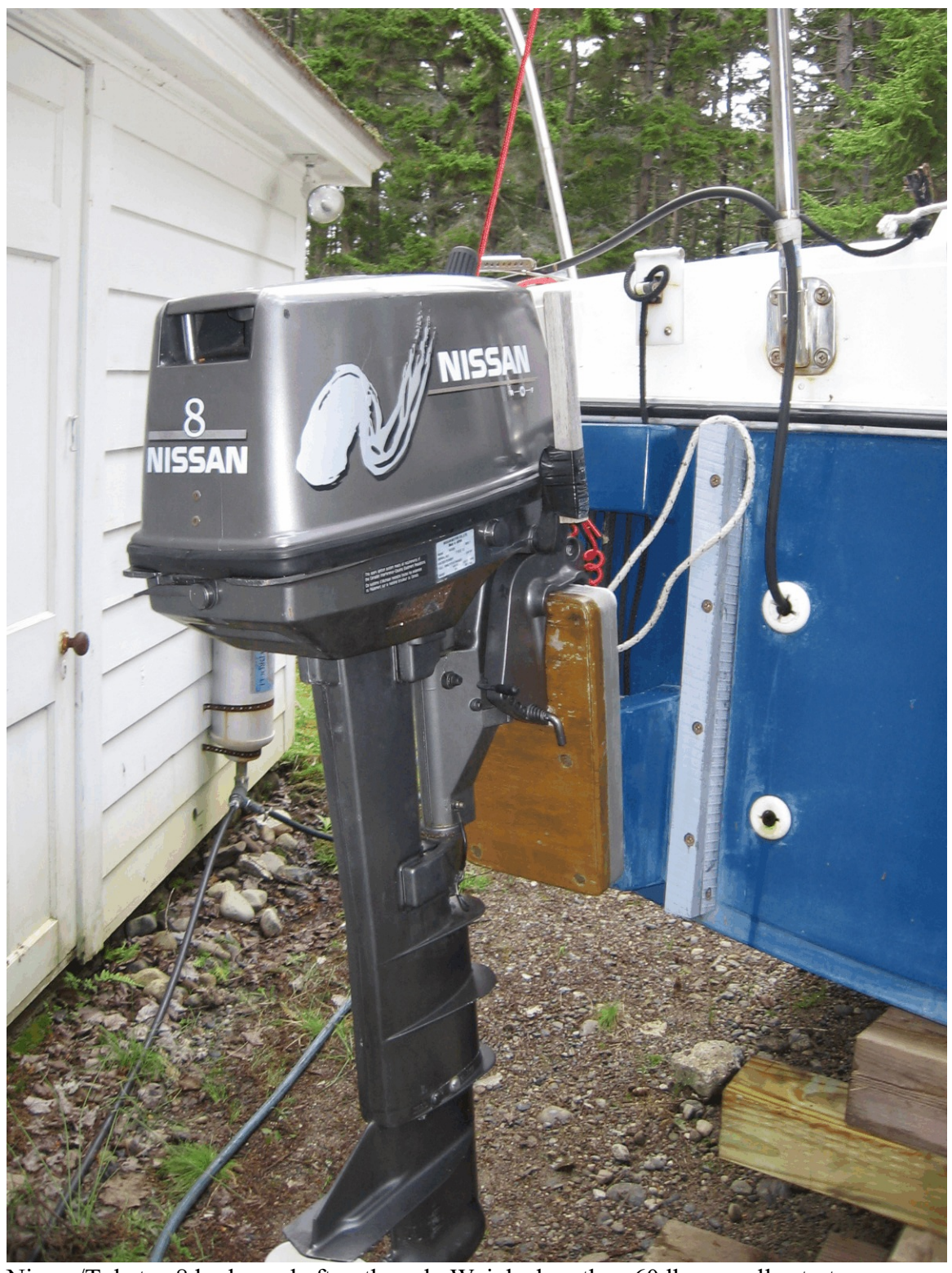
Nissan/Tohatsu 8 hp long shaft outboard. Weighs less than 60 lbs, usually starts on one pull, often with no choking required.