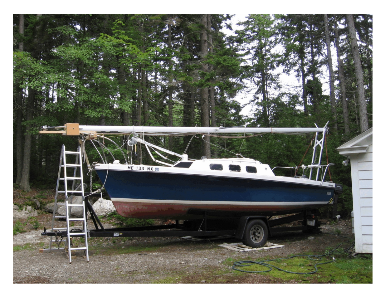
Orion getting ready for 2011 winter cover. Note crane is ready for next season's mast raising.