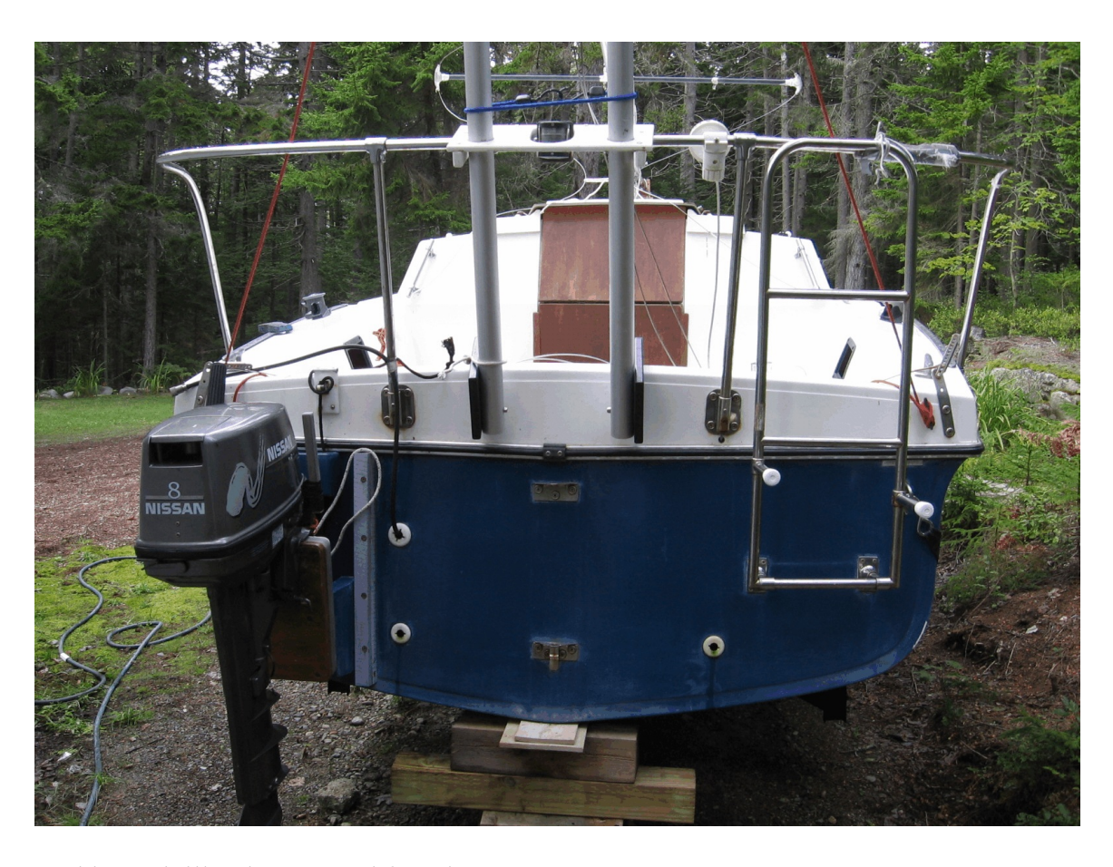
Rudder and tiller de-mounted for winter storage