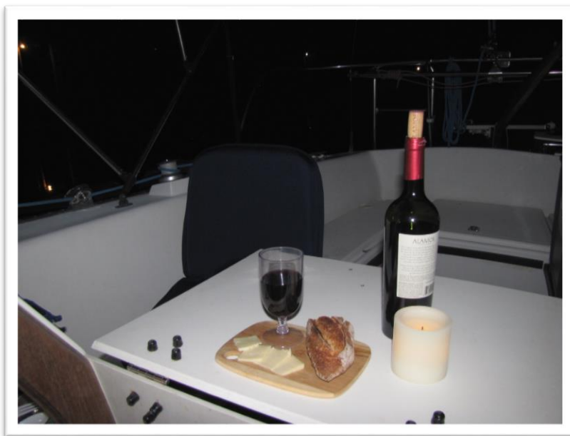
Tranquil time extended