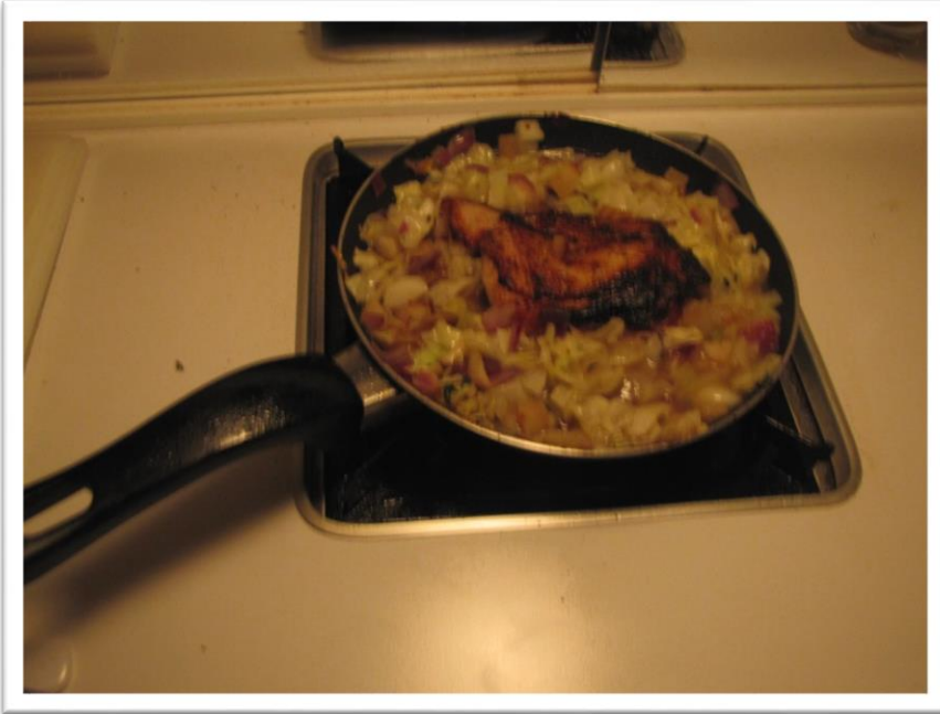
Chicken with autumnal vegetables