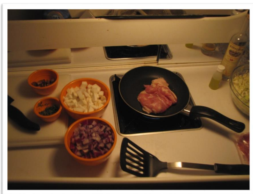
Out of the Rhodes 22 gourmet galley