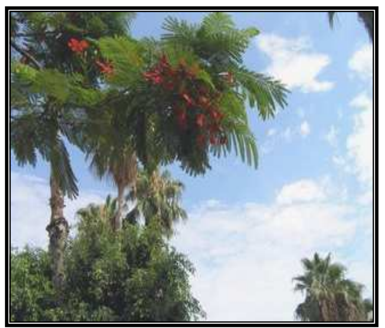
Such a contrast between these beautiful green trees and the harsh desert that surrounds Loreto

visiting boats! I docked and wandered over to the harbormaster in a building he shares with the national parks administration. We sat in the shade and talked about boats. fishing and family. He was very well spoken and articulate in English. He even could make a great joke. When I asked him if he was from the area he said "Yes, my brothers and I grew up here in Loreto, not much, but some." When I asked about the cost of the dock he said no charge as long as I don't stay too long. Neat quy! Actually he was typical of everyone we met during the entire trip. Without exception, evervone was helpful and proud to share his or her