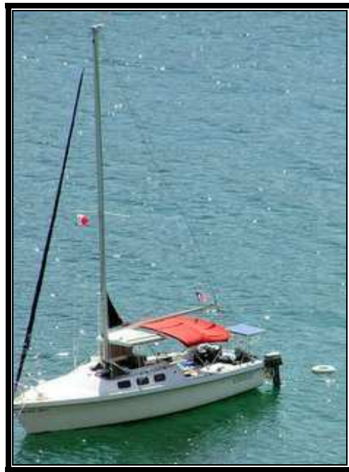
Bimini and solar panel in “action”.

Bimini: An absolute must in this kind of sailing environment! The sun is so intense it actually hurts when it shines directly on your skin. To be able to motor & sail on most points in the shade really made the trip enjoyable. When anchored we often used side panels. I won't be leaving home without my Bimini!